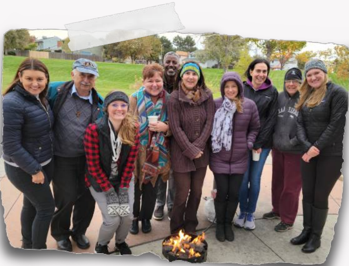
Some members of the AHA Board braved the cold and wind to meet briefly in person (October 2021)

AHA envisions a community where all residents have an opportunity to achieve optimal health.